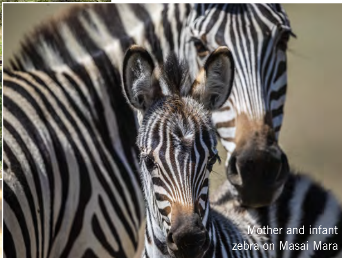
Mother and infant zebra on Masai Mara