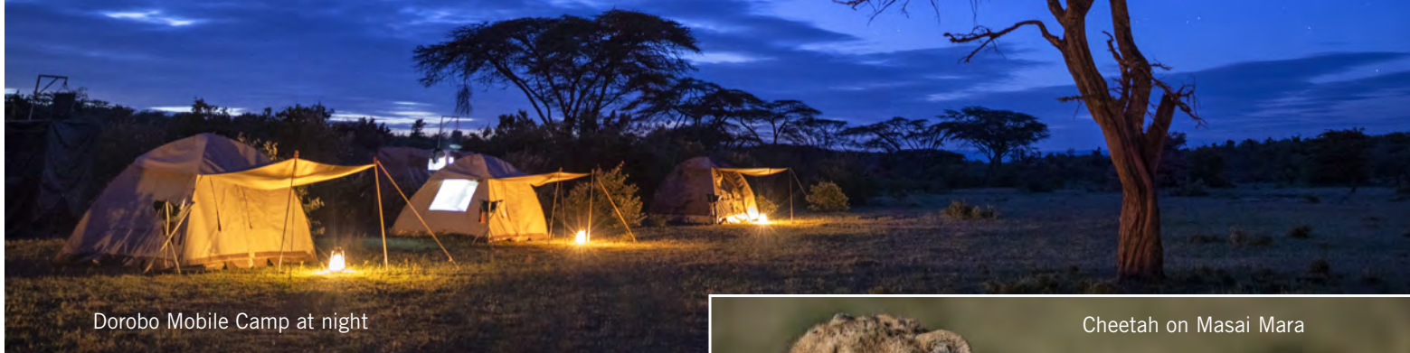
Dorobo Mobile Camp at night

WORDS BY DUSTIN O'REGAN