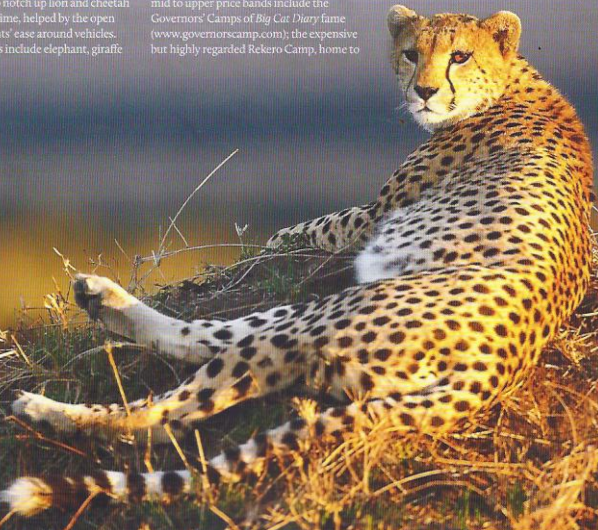
Wandering spread: A Maasai guide welcomes you to Mount Kenya Wanderlust: 'Golden hour' in the Masai Wildlife: you might even spot a cheetah

Add on: Combine a Masai Mara safari with time on the south Kenyan coast or the Lamu Archipelago (check Foreign Office advice before booking); here, try diving, windsurfing, a dhow cruise - or simply relax. >>